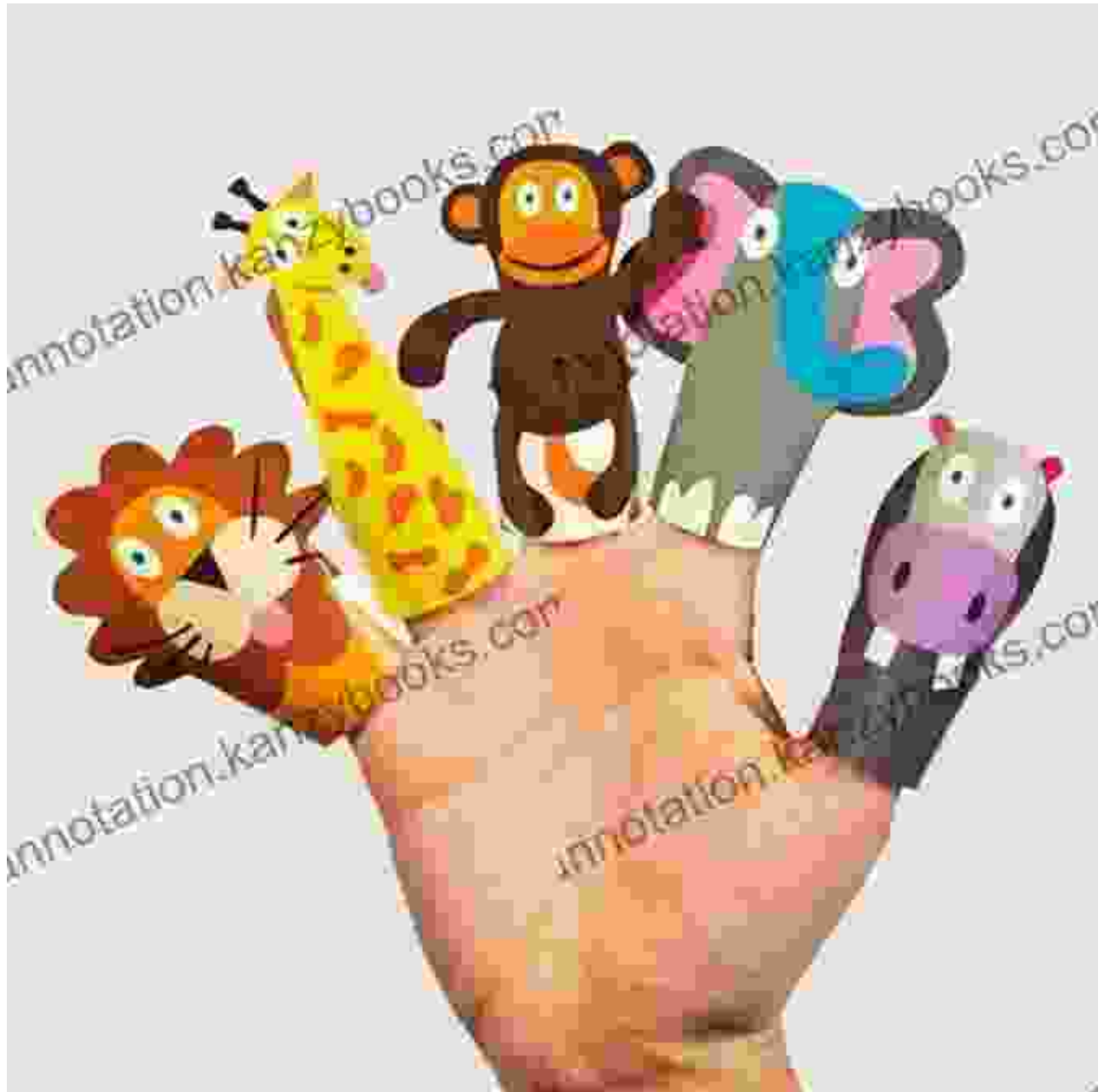
Interactive Finger Puppet Fun: Bringing the Story to Life

What sets Baseball Children apart is its innovative use of finger puppets. Each character is represented by a charming finger puppet that children can interact with as they read the story. This hands-on experience enhances their engagement, fosters their creativity, and develops their fine motor skills.