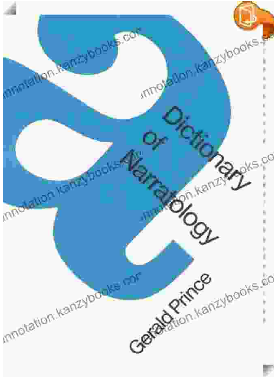
A Dictionary of Narratology by Gerald Prince

Available in hardcover, paperback, and e-book formats from all major retailers.