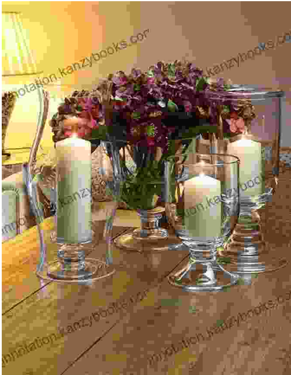
Imaginative Menus That Impress

dishes. Our recipes extend beyond the traditional, offering innovative takes on classic favorites and introducing you to culinary traditions from around the world. Whether you're looking for a festive centerpiece or elegant appetizers, our cookbook has everything you need to make every celebration a culinary triumph.